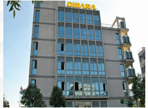
OMARA Research and Development Center Nanning, PRC

What sets Omara apart is our agility and client-centric focus. We combine deep technical customization with flexible production capabilities. This empowers our customers to deploy systems that are perfectly tailored to their unique operational environments and specific requirements.